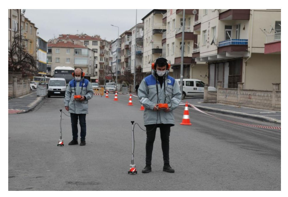
Figure 2: Sample Fault Detection Process with ground microphone

In the cost-benefit analysis of this method, after obtaining the data on the total line length and subscriber numbers of the network to be studied, the total water loss in the network must be calculated in l/km/hour (Yilmaz et al., 2023). The current average network pressure of the system and unit water costs should also be defined as variables. The benefits and possible costs that can be obtained were calculated using the following data, while making the cost benefit analysis of this method.