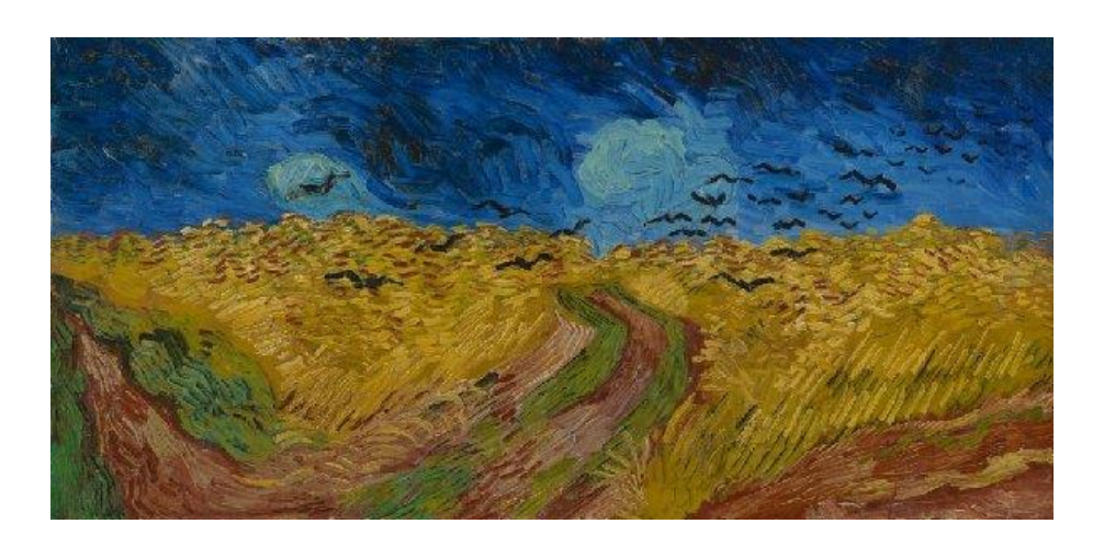
Figure 3 "Wheat Field with Crows", 50.5x103cm, Auver-sur-Oise, June 1890, Van Gogh Museum Amsterdam