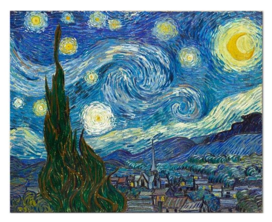
Figure 2 His' 1889 Oil Painting Measuring 73.7 Cm×92.1 Cm. Museum of Modern Art, New York City