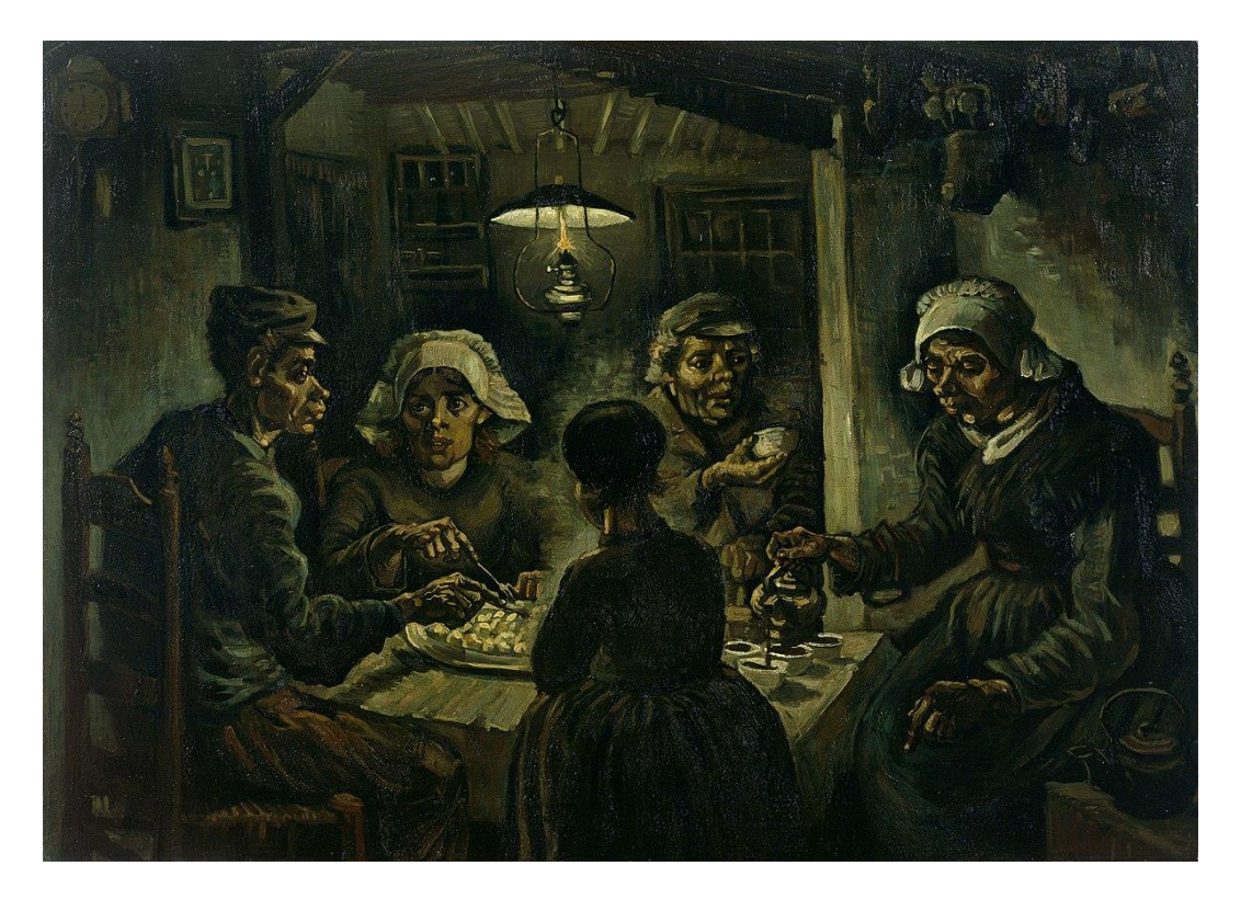
Figure 1 His' painting 82 x 114 cm, painted in Nuenen in 1885. Van Gogh Museum, Amsterdam

His understanding of art and the fact that his works received much criticism was due to his disregard for academic rules and his use of dark colours. -At the time, such a painting was unacceptable- as in Figure 1. However, in this work, which depicts a group of people eating potatoes around a table in a very realistic way, the breaking of the known rules, the deformation of the figures and the free use of colour would later influence the Expressionists and their successors in contemporary and modern art. Van Gogh, who turned to vivid colours in the company of the Impressionist understanding, later broke away from this understanding and developed a new artistic technique. The colours in the works of the artist, who struggled with his new understanding of art in the later years of his life, lost their intensity and his lines became harsh and pessimistic, reflecting his restlessness. Vincent van Gogh began to apply thicker and more violent layers of paint to his canvases, depicting swirling suns, twisted cypresses and swelling mountains. On the other hand, as his illness worsened and he was admitted to the Saint-Paul-de-Mausole asylum, Vincent van Gogh began to use bright, vivid colours in his most famous work, The Starry Night, and in other works (Figure 2).