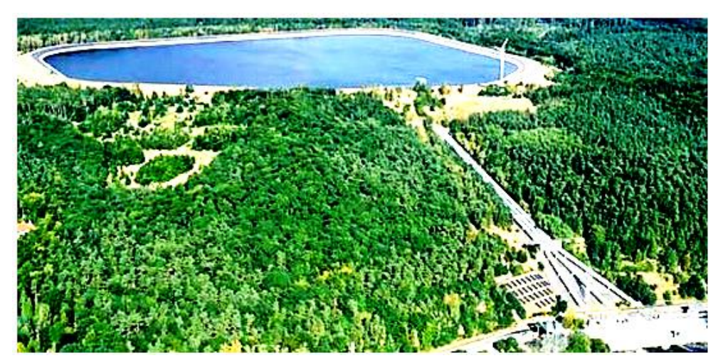
Figure 5. An example of Pumped Storage Hydroelectric Power Plant [23]

Another type of hydroelectric power plants is pumped storage plants (Figure 5). They store the water in the next pool by pumping the water with the energy obtained from grind when there is low energy demand. When there is high demand of energy, water accumulated in the upper pool is transferred to the pool below and this way energy is generated. In practice, pumped storage hydroelectric power plants do not increase total amount of energy generation of the country where it is established. They just help to ensure supply and demand equilibrium by transferring waste, disused energy to most valuable and most expensive time period. These types of energy have been used in developed industrial countries since the beginning of 1950s [12].