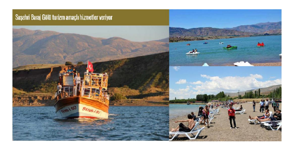
Figure 3. Su Şehri dam (Kılıçkaya Dam Reservoir) that contributes to tourism [19-20-21].