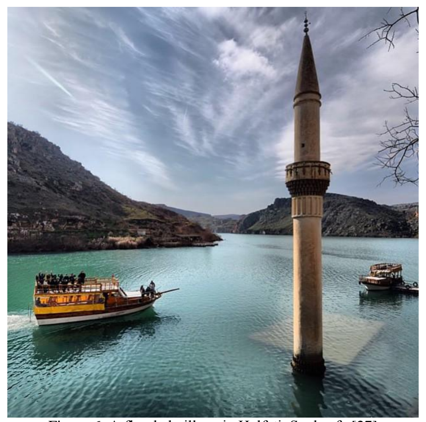
Figure 6. A flooded village in Halfeti, Şanlıurfa [27]

Sometimes, architectures are flooded during the construction of the dam. These structures led to increase of touristic trips and in this way a disadvantage turns into advantage. For example, Figure 6 shows the minaret of a flooded masque in Halfeti, Şanlıurfa, Turkey. The touristic excursions are present since the construction of the Birecik dam.