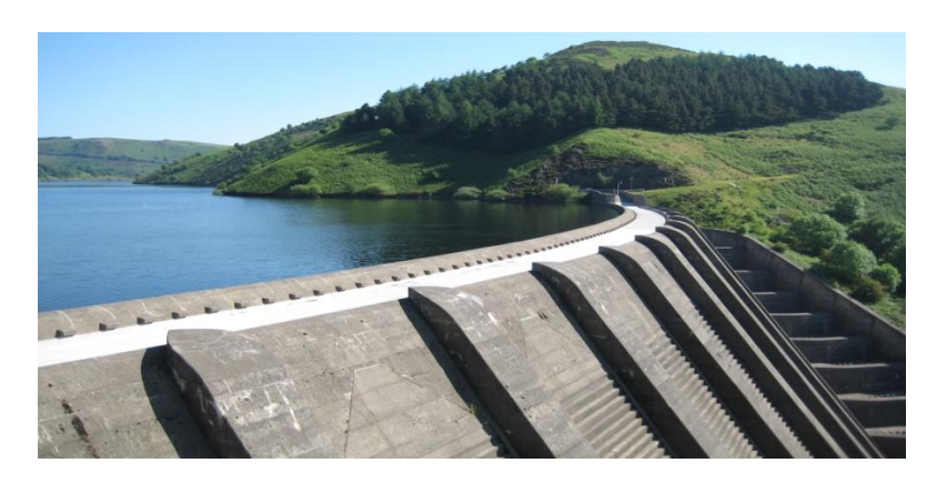
Figure 2. Impoundment Hydroelectric Power Plants (Dam) [17]

In impoundment types of hydroelectric power plants, water is blocked by a dam and a reservoir is constituted behind the dam (Figure 2). In this way, water that comes from the rain in rainy weather is accumulated in this pool. Necessary water is provided from this pool in dry and droughty seasons.