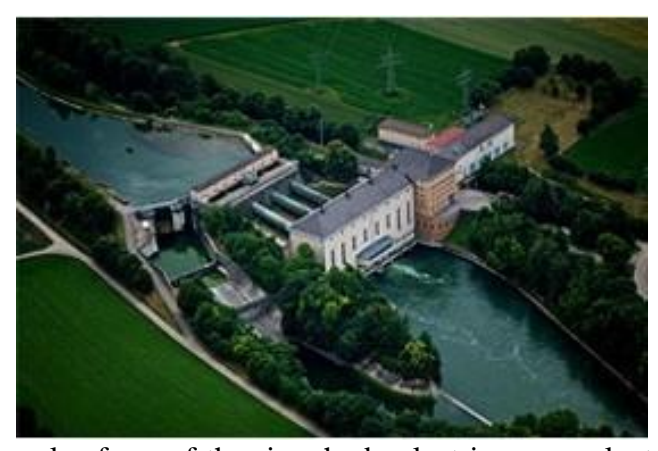
Figure 4. An example of run-of-the-river hydroelectric power plant (Regulator) [22]

Run- of- The River types of hydroelectric power plants are established on rivers and amount of water level is risen by a regulator (Figure 4). In this way, to get the water becomes easier and a little head is obtained. There is no flow rate regulation in these kinds of plants, therefore the amount of energy to be generated changes depending on the season. Majority of this energy is secondary energy. This incident is exact opposite in impoundment dams, that is to say majority of the generated energy is reliable (stabilized) energy. If there are big dams at source of the run-of-the-river plants and if regular flow rate, which is obtained from the pools of the dams, is used by run-of-the-river plants, the amount of generated reliable energy by run-of-the-river plants increases.