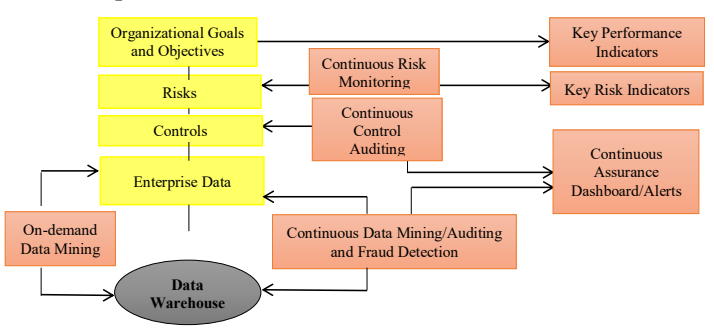
Figure 1: Continuous Risk/Control Assurance Model

The continuous audit has two main parts, continuous risk assessment and continuous control assessment. Continuous risk assessment means the audit activities that determine and evaluate risk levels exist across the entity by assessing and comparing trends in processes and systems. When it comes to continuous control assessment, it means those audit activities evaluate weather selected controls are working properly or not (Coderre, 2007, pp.2-3). The situation of continuous control assessment and continuous risk assessment in a continuous audit model is shown the figure below. This model, which is called a continuous risk and control assessment and continuous risk assessment and continuous control evaluation processes.