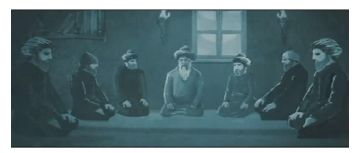
Figure 1. An Image of Yusuf Has Hacib Depicted in Conversation

During the experimental process, the materials used in the lessons taught to the experimental group were developed by the researchers. First, research on the subjects to be taught in the lessons was done and scenarios were planned regarding the order of the information to be taught. These mentioned scenarios were prepared by two faculty members with PhD. Then the pictures and animations that are suitable for the content of the scenarios are drawn by the experts. A total of 4 activities -one of which were related to each topic- were designed by the researchers. Students were able to view the design of the relevant activity when they read the QR codes previously distributed to them via the AURASMA 3D app, which was preinstalled on their smartphones. Some visuals of the designs created with ART are presented below.