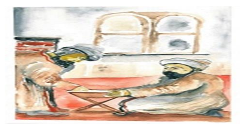
Figure 2. An Image of Kasgarli Mahmud Depicted While Teaching in the Madrasa