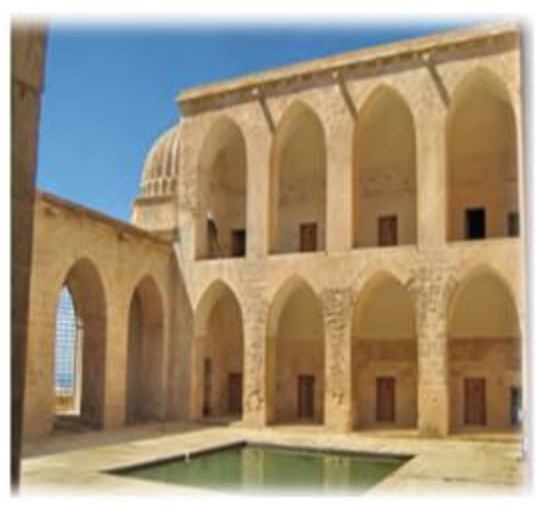
Table 3. In The 5<sup>th</sup> Grade social studies textbook, architectural works of Turkish Islamic States