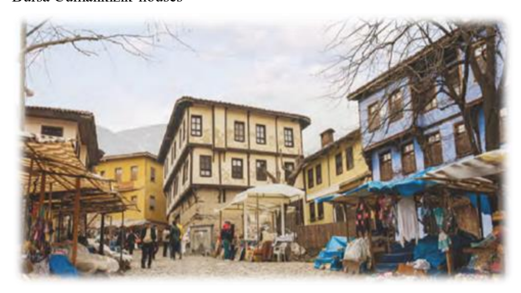
Figure 2 Bursa Cumalıkızık houses

In Figure 2, these historical houses located in the village of Cumalıkızık in Bursa during the Ottoman Empire are at the forefront with their extremely elegant and impressive colors. This building is one of the important cultural treasures of the region. It is also visited by thousands of tourists every year, increasing its attractivenessIt is stated that the architectural structure in visual 3 on the side is a historical fountain built in Edirne during the Ottoman period. It was explained that the future of this work, which was built according to the Turkish Islamic architectural tradition, was under threat because its writings were erased and some paints were used on it. Thus, it was aimed to draw attention to the issue in order for children to gain sensitivity towards Turkish Islamic architectural structures and to have the awareness of protecting historical structures.