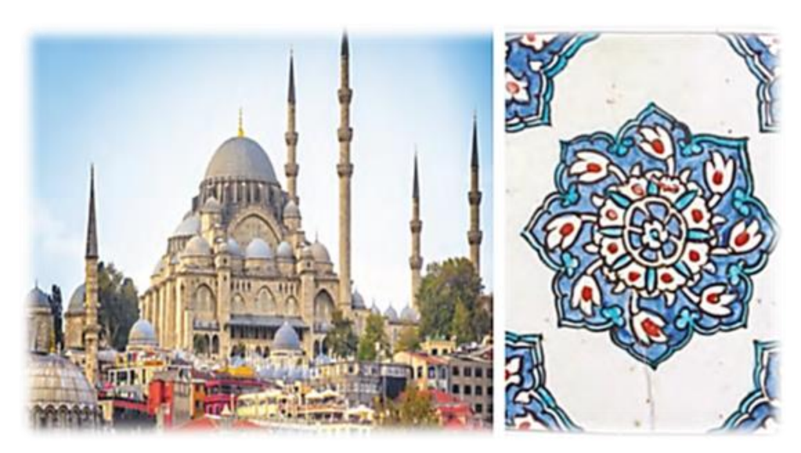
Figure 4 Süleymaniye Mosque and Topkapı Palace Tile panels (Evirgen, et al, p. 46).

Built by Mimar Sinan the Architect, the Süleymaniye Mosque is aesthetically impressive and can be seen even from far away, providing an elegant image with its four minarets. Offering an incredible visual feast with its fountain, courtyard and high dome, this building is one of the masterpieces of Turkish Islamic architecture. In addition, the tile panels in Istanbul Topkapı Palace were used as indispensable in the art of decoration of Turkish Islamic architecture.