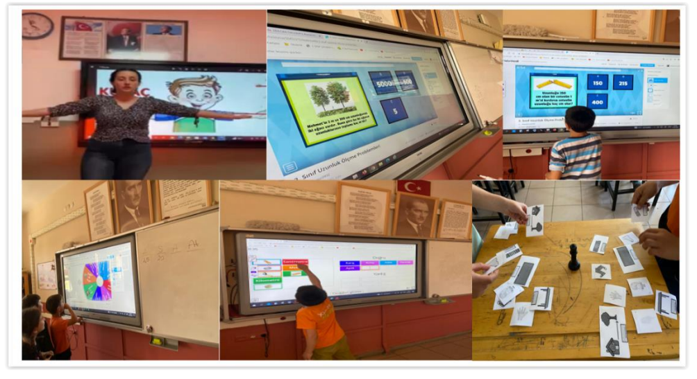
Figure 2. Practices images

In the practices, digital games prepared by the researchers were used. Interviews were held with the mathematics field expert, classroom teacher and an assessmeny and evaluation expert regarding the suitability of the content of the games. In addition, the educational games prepared by Aykaç and Köğce (2021) were used with permission.