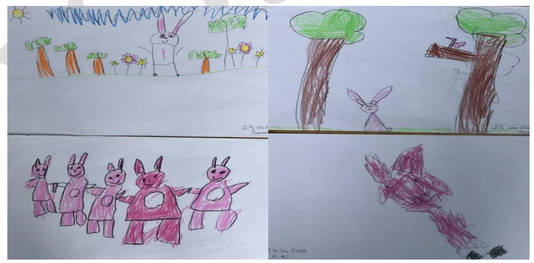
Figure 3. Children's drawings about the "Pink Rabbit Story".

Session 3-Storytelling "A Day with the Pink Rabbit": This workshop was based on a story about a rabbit living in the forest. Children played roles as characters in the story and improvised the scenes encountered by the rabbit and its emotions. The Pink Rabbit song was sung with the Orff Instruments. Afterward, questions were asked, such as 'Which instrument resembled each character and its emotions? Why?', 'How can we express emotions with these instruments? At the end of the session, children draw pictures about the story of the Pink Rabbit (Figure 3).