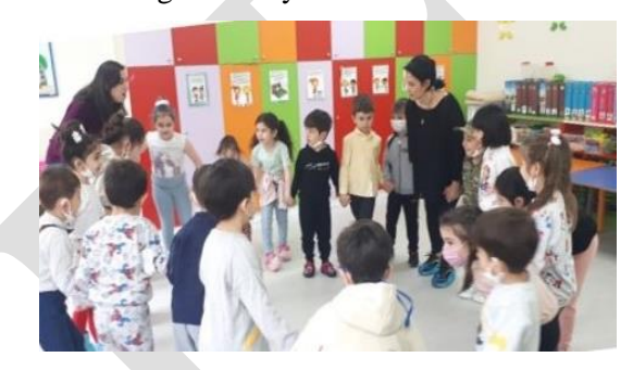
Figure 1. Discussion on emotions in daily life.