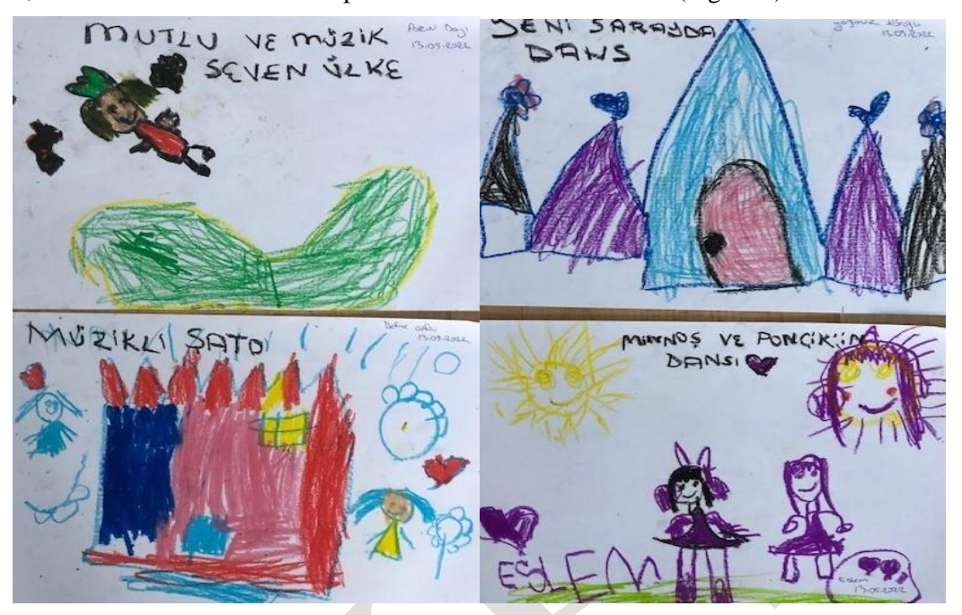
Figure 8 . Children's drawings about the "The Unhappy King without Dreams".

little pieces they created. Some children improvised through a dance drama with the help of the teacher. In the end, children were asked to draw pictures related to the narrative (Figure 8).