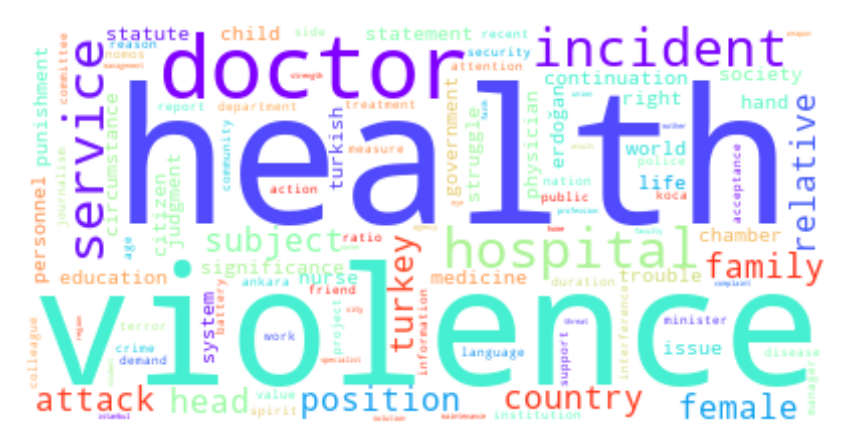
Figure 3. Content Analysis Regarding the Contents

When the summaries of the news obtained were analyzed using content analysis method, the most frequently used five words were found as "health", "violence", "attack", "family" and "incident" (Figure 2, Table 1). At the end of the trigram made about the abstracts, the word groups "Recep Tayyip Erdoğan", "health violence incident" and "gun attack result" were widely used.