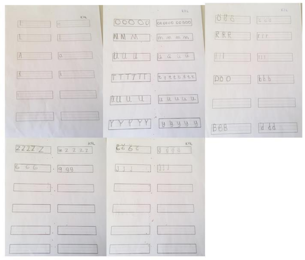
Figure 2 shows the letter theme exercises performed by Participant 1, a control group participant. Participant 1 completed the lines to the end only in the second "Letter-group" activities. However, he could not complete the lines to the end in the other "Letter-group" activities. Although it seemed like P1 wrote all the letters correctly, he only wrote the upper-case letters "Z," "K," "U," and "T" and the lowercase letters "e," "l," "k," "u," "t," "y," and "z" (Figure 2).