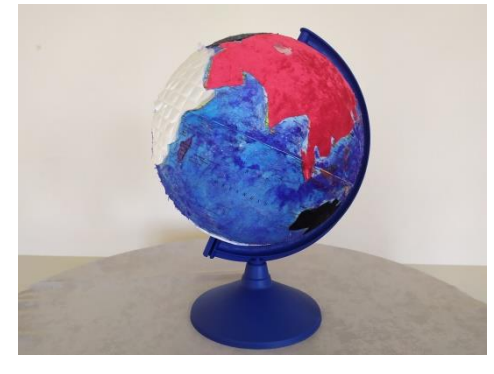
Figure 1. A visual of Earth model

Each workshop included three modes of mentoring as "discussion," "material development," and "feedback and reflection." At the beginning of the workshops, discussions were held with regards to the objectives and the potential materials that could be developed based on the characteristics of the target group. Each group undertook a brainstorming activity and then decided on the specific features of the materials they would develop prior to commencing the material development process. The groups each worked collaboratively throughout the process. After completion of each item of instructional material, feedback and reflection sessions were then conducted. The mentors visited each of their groups and provided them with feedback, and discussed the materials that they had developed.