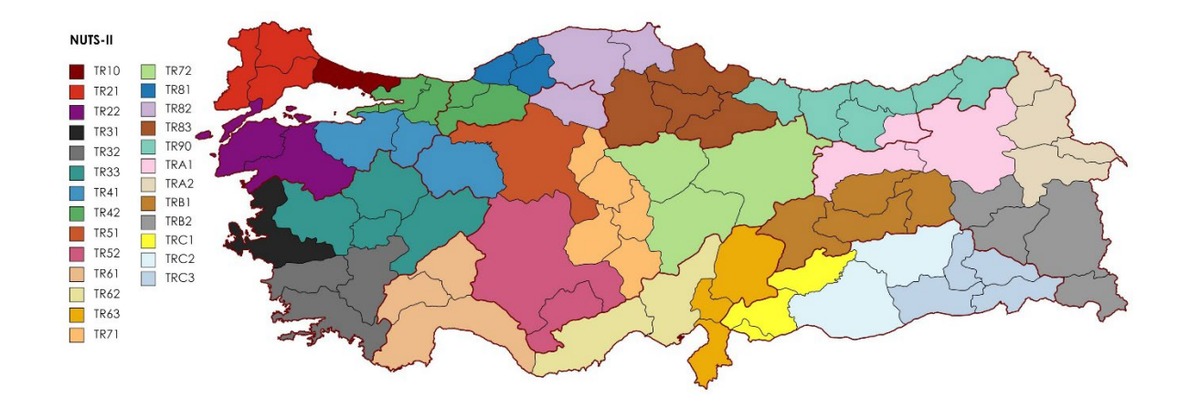
Figure 2: NUTS-II regions in Türkiye

Only a limited number of publications are available relevant with Hands-On Entrepreneurship Trainings, which have been organised by KOSGEB since many years. In this study, a comprehensive analysis is carried out on the extent to which Hands-On Entrepreneurship Trainings contribute to the entrepreneurship culture on the basis of provinces, NUTS-I and NUTS-II regions. The parameters at the forefront in the process of performance evaluation for entrepreneurship ecosystem are also determined in this context.