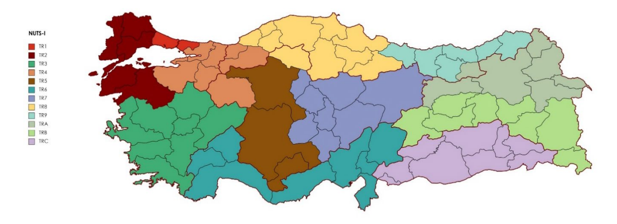
Figure 1: NUTS-I regions in Türkiye