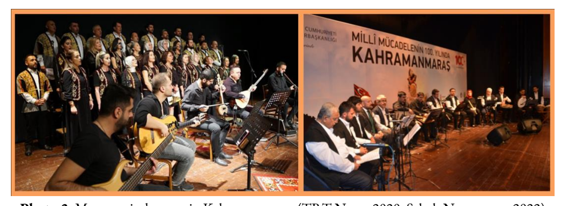
Photo 2. Mass musical events in Kahramanmaraş (TRT News, 2020; Sabah Newspaper, 2022)

Çelik (2023) has stated that individuals facing such destructive disasters may exhibit post-traumatic symptoms. According to Çelik, these symptoms can manifest in various ways, such as cognitive, emotional, behavioral, affective, and sleep problems. The researcher has also noted that other studies have shown that individuals may encounter psychological problems after earthquakes, such as depression, anxiety, sleep problems, physical symptoms, dissociative disorders, and sexual dysfunction (p.576). In a study conducted by Kardaş and Tanhan (2018) on individuals who experienced the Van earthquake, the relationships between post-traumatic stress symptoms and psychological resilience were examined. This study revealed that psychological resilience decreases when symptoms such as avoidance, reexperiencing, and irritability increase after the traumatic event (p. 1-36).